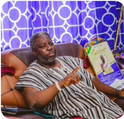
Nii Afotey Botwe II